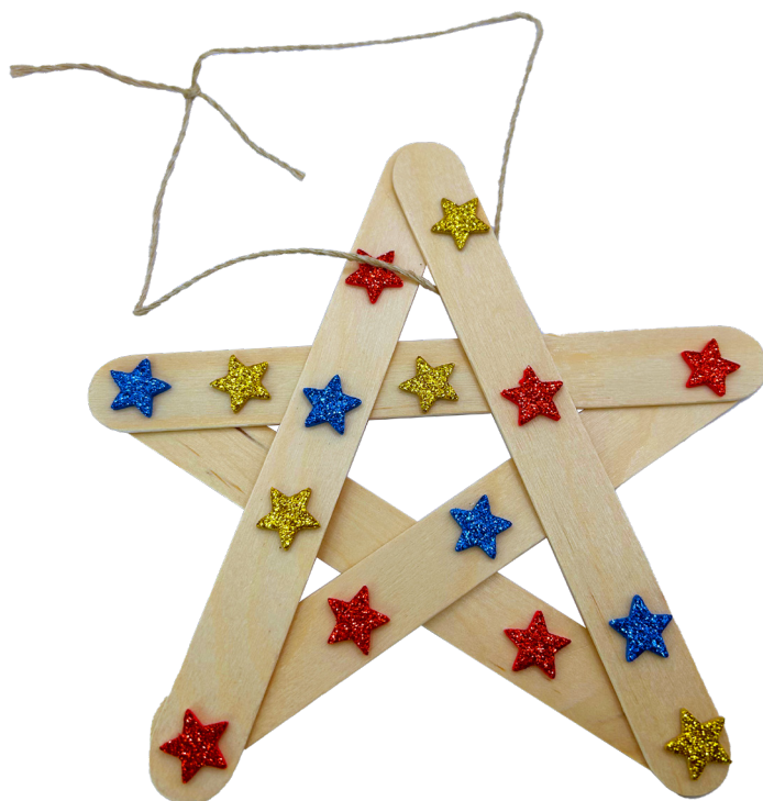
STEP #5: FINAL

STEP 5: Let it dry for a few minutes, then kids can decorate with stickers and markers. When you finish, you can tie a ribbon to the top. Take your ornament home as a reminder that God keeps His promises! The greatest promise is Jesus! God sent Jesus to save us!