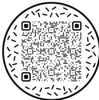
Faithful Preschool Spotify playlist