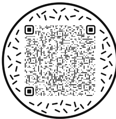
Transformed Elementary Spotify playlist